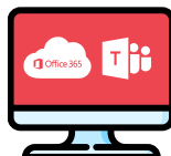
Virtual/Online Meetings via Microsoft Teams