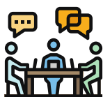
In-Person and Online Individual & Group Meetings