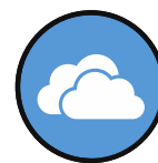
Office 365 OneDrive